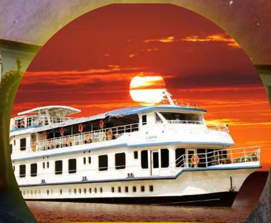
Brahmaputra River Cruise