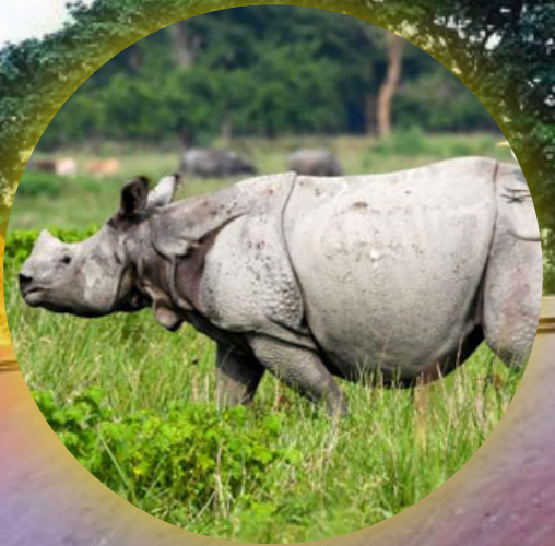
Pobitora Wildlife Sanctuary