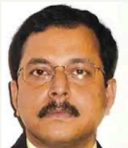
Past President & Chief Advisor: