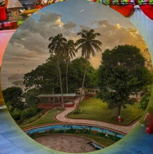
Brahmaputra Heritage Centre