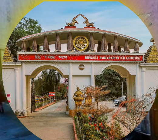
Srimanta Sankaradeva Kalakshetra